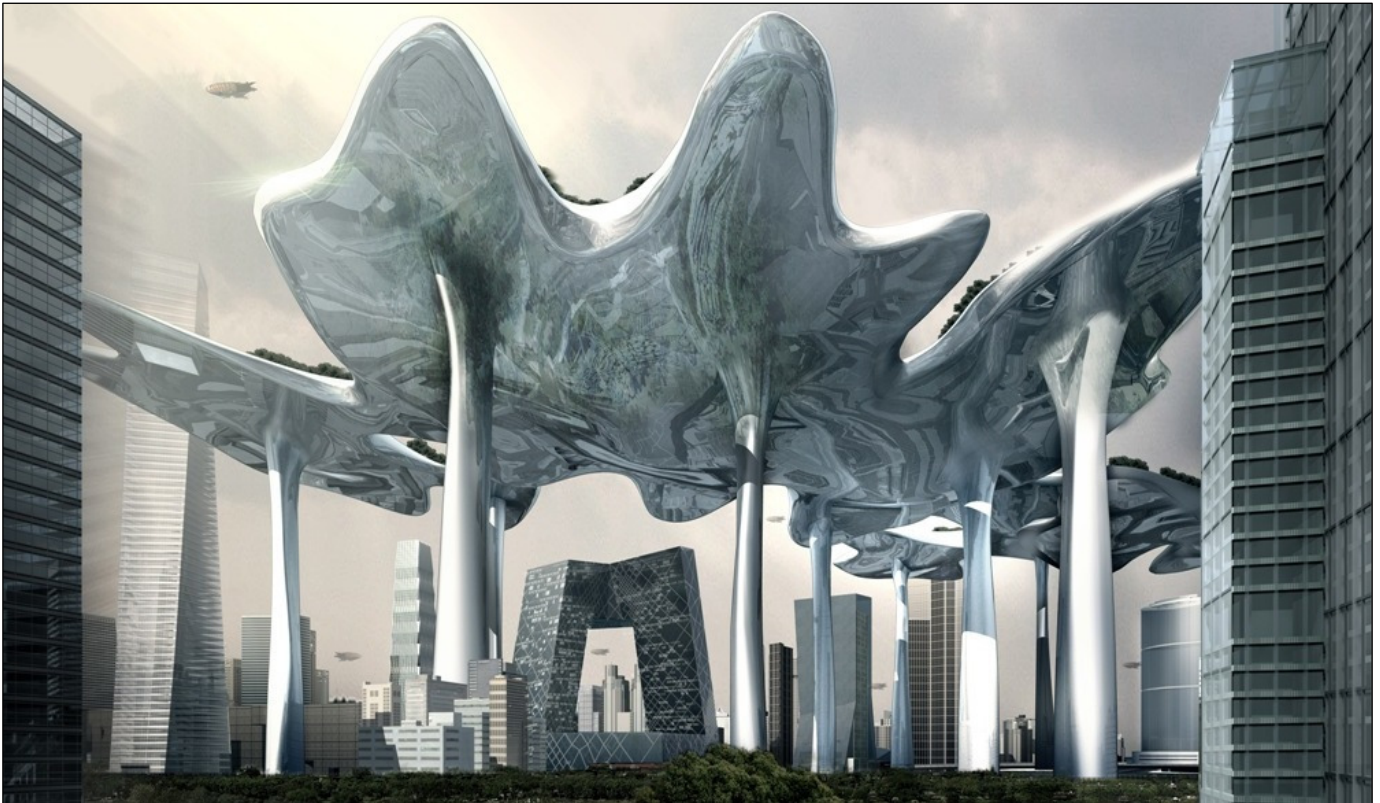
Beijing 2050, MAD ( www.i-mad.com )

Creativity is a key factor whenever existing norms, values, and 'ways of doing things' are challenged. Entrepreneurs, engineers, designers, artists are all agents of creativity. So are many less privileged people who on a daily basis adjust to life in the swiftly changing Asian political, economic and cultural landscapes.